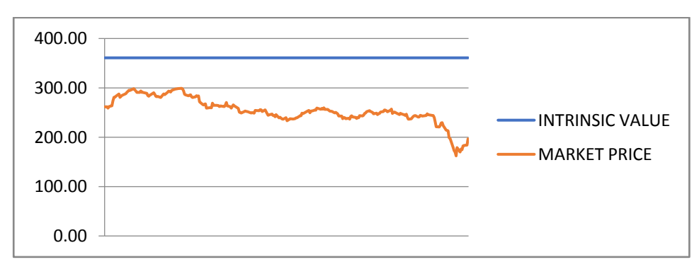
Figure 10: Intrinsic value vs Market price (INFOSYS)-2017-18

The market price of WIPRO as on March31,2017 is 261.65. Since the intrinsic value is above the market price, the share is under -priced and hence it is recommended to buy the share.